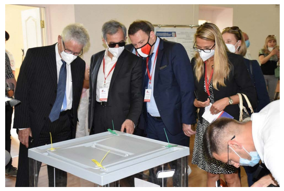
French far-right MEPs in Russia-annexed Crimea