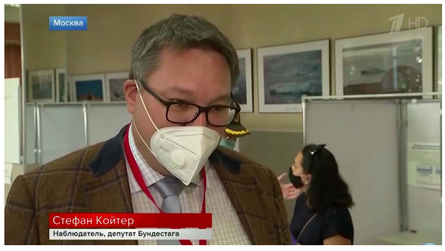
German far-right MP Stefan Keuter incorrectly captioned as an "observer" on the Russian state-controlled "Pervy kanal" TV channel: "My personal view is that the level of organisation in Russia is higher even than in Germany"